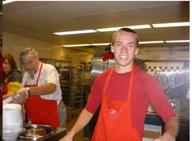
SALVATION ARMY FISH FRIDAY