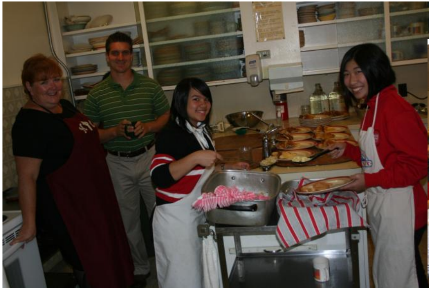
HOLY TRINITY BREAKFAST PROGRAM