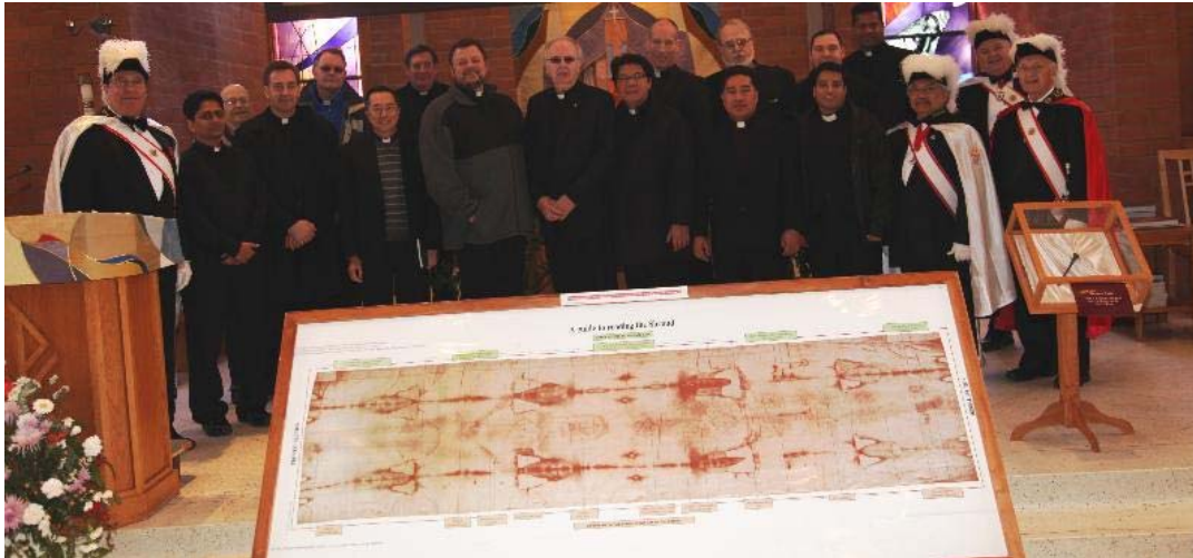
Our Deanery priests visiting the Shroud of Turin exhibit at Our Lady of Mercy last Spring.