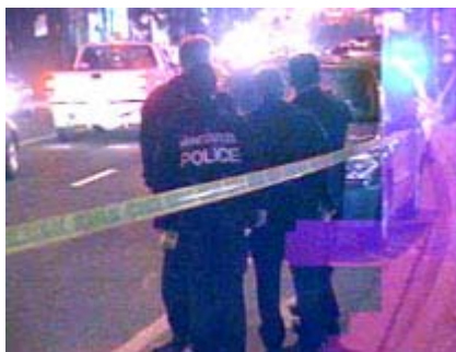
VPD at a shooting scene.

The city we all know as home has slowly drifted away from the one we once knew. The streets we could easily walk down in the evenings are no longer as safe as we once thought. The parks are off limits because in the back of our minds, we envision our names being on the front of the local newspaper as the next target. Civilians are hesitant to enter a certain part of town because of what they've seen happen. We have all heard about the numerous shootings that have been occurring in our city, along with other major cities nationwide. These events are picking away at the city's last ounce of hope.