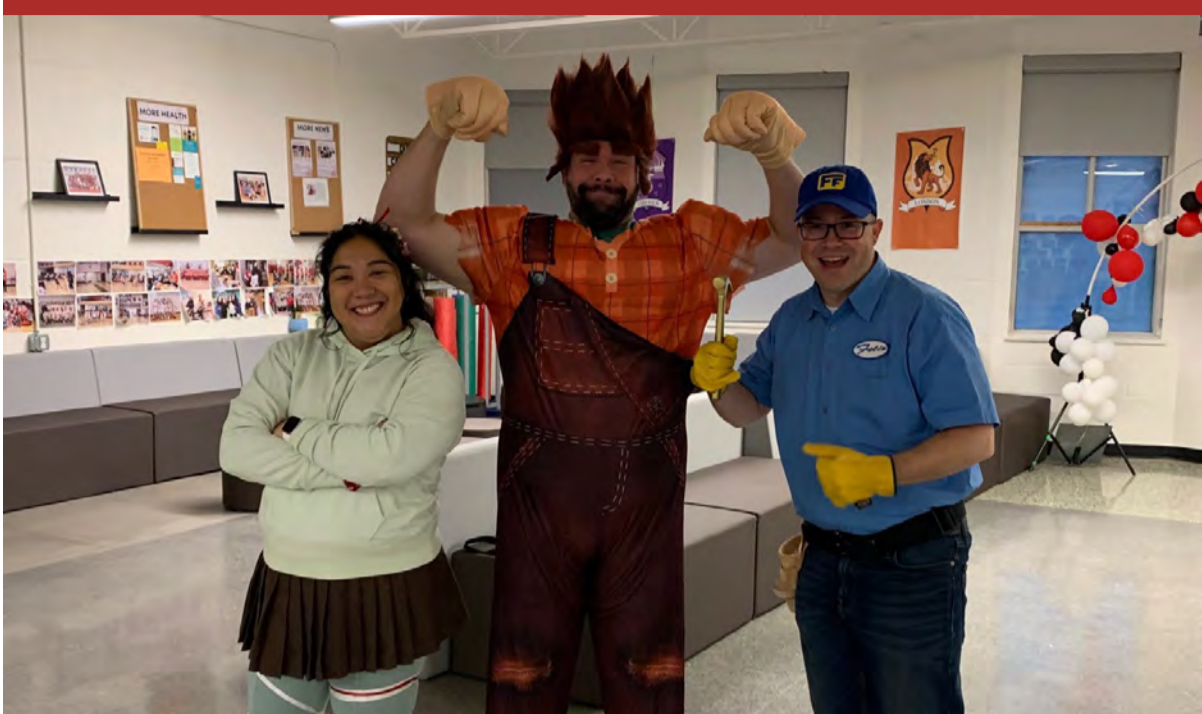
The Admin Team dressed up as the Wreck-It-Ralph crew for Halloween!